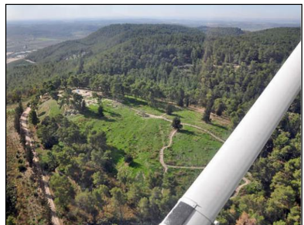
The ruins of Zorah from the air

In his victorious death Samson's agitation ceased and he was buried in Zorah. The spirit had finally triumphed in him.