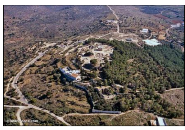
Sepphoris today from the air