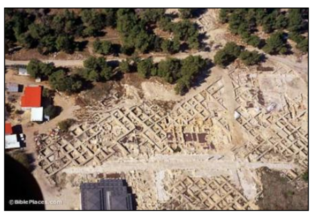
This aerial view gives an interesting perspective of the extent of the archaeological work