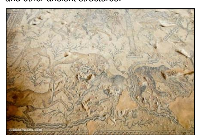
The Nile mosaic in Sepphoris

During this long period it lost much of its cultural significance and importance, although it was known for its olives, wheat, and pomegranates. In 1948 it was the largest Arab village in Galilee with some 4,000 inhabitants. On 1 July 1948 it was bombarded by Israel and captured in operation Dekel. Most of the residents were evicted and many subsequently relocated to Nazareth. They now mostly live in the al-Safafira quarter of Nazareth. Today Zippori is an amazing archaeological park full of beautiful mosaics and other ancient structures.