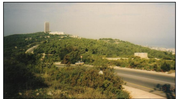
Above: University of Haifa atop Mt Carmel 1996