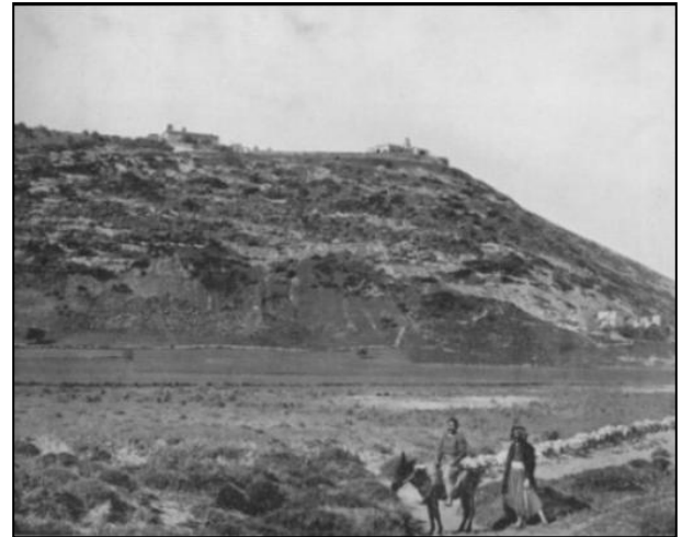
Above: View of Mt Carmel in 1894