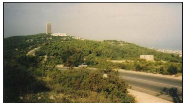
Above: University of Haifa atop Mt Carmel 1996