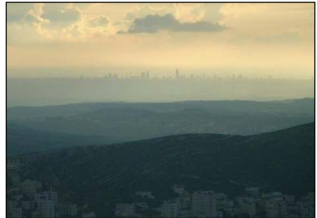
Looking west from Mt Ebal towards Tel Aviv