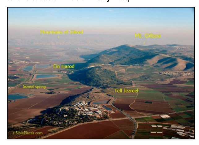
In 1921, during the British Mandate, Kibbutz Ein Harod was established here. It served as a training base for the Special Night Squads

The Mamluks were powerful cavalry warriors and eventually forced the Mongols to retreat to the area of modern-day Irag.