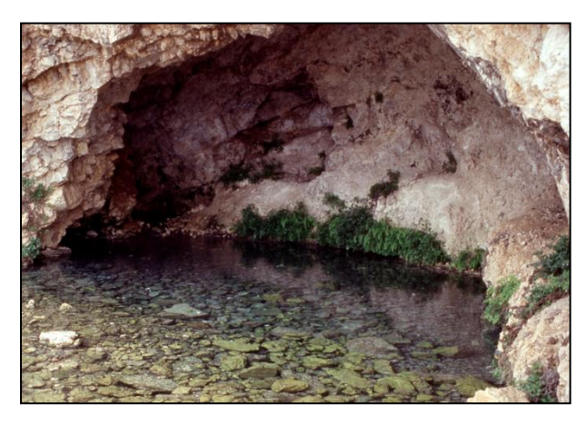
The so-called "Gideon's cave"

A small flow of fresh water (less than 1 metre deep) continually streams out and down into the Valley of Jezreel.