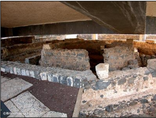
The remains of what archaeologists believe may be Peter's house or one like it