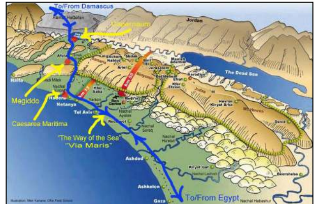
The Via Maris from Damascus to Egypt

The major trading road leading to Damascus, the Via Maris (“the way of the sea”) passed nearby, providing a commercial link with regions to the north and south.