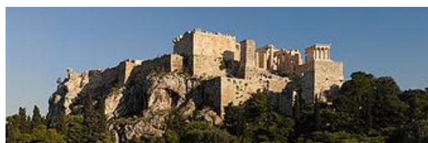
View of the Acropolis from the Areopagus hill